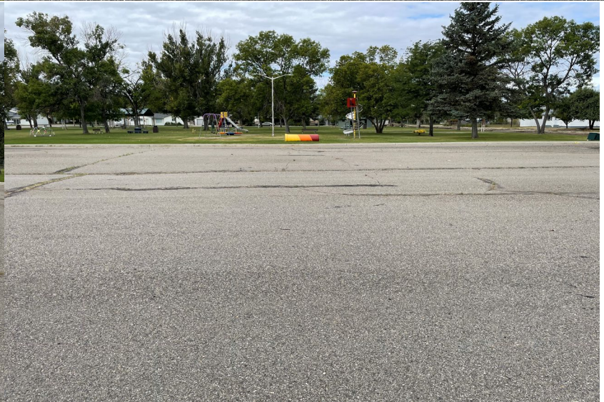
South Park Splash Pad Project Location, City of Hardin MT, 59034